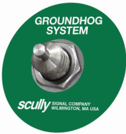
Scully Ground Bolt