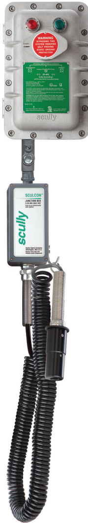
Scully Groundhog Control Monitor with Plug and Cable