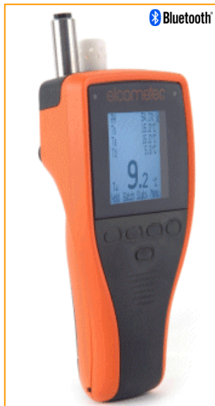
Elcometer 319 Dewpoint Meter with Bluetooth ®†