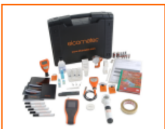
Elcometer Inspection Kits

The new version of the Elcometer 456 now benefits from a larger display for easy data viewing and a simple calibration feature to make testing even quicker. The Elcometer 456 also features Bluetooth® wireless technology for fast data transfer to ElcoMaster™ Software, ideal for easy report generation and archiving of readings.